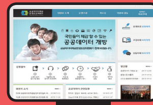
Open Data Mediation Committee www.odmc.or.kr