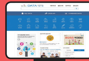
Open Data Portal www.data.go.kr

Introduction of Committee, System and Procedures of Dispute Mediation, Application, Request and Consulting for Dispute Mediation, Trends in Dispute Mediation etc.